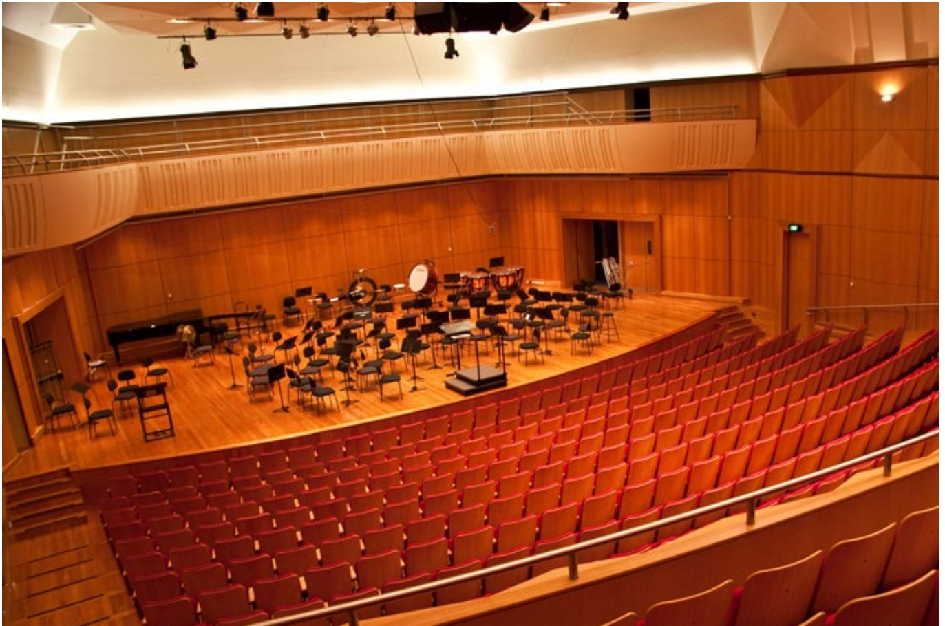
Ian Roach Hall