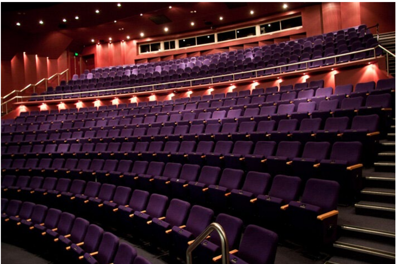
Geoffrey McComas Theatre