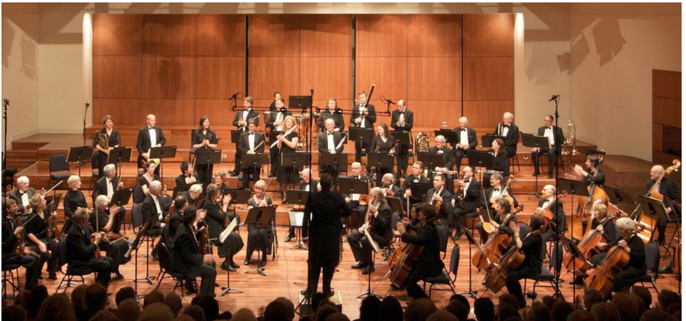
James Tatoulis Auditorium, MLC